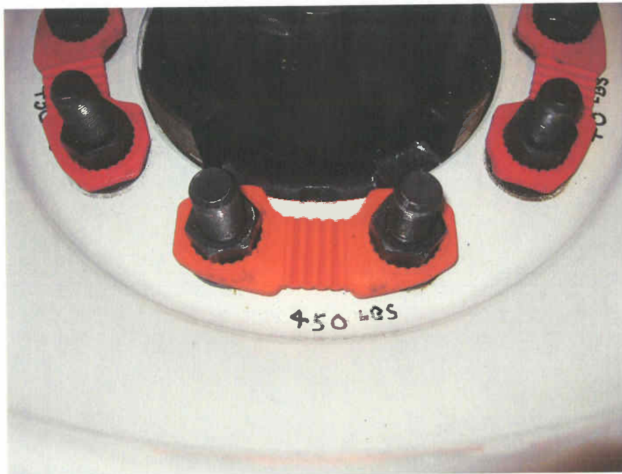
Figure 6 : Sample 10-03-C0152-4 installed on 450 ft-lb torque nuts