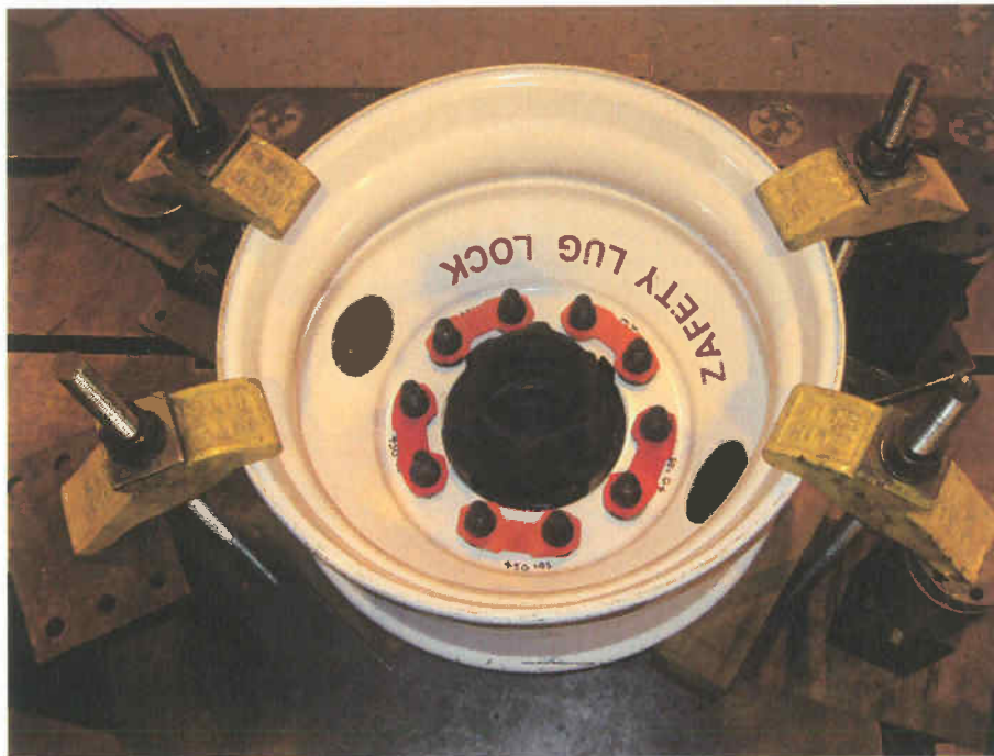
Figure 2 : Test set-up – Samples installed on nuts, steel drum