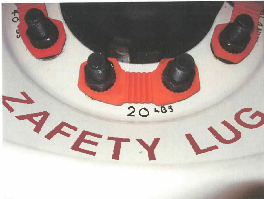
Figure 4 : Sample 10-03-C0152-2 installed on 20 ft-lb torque nuts