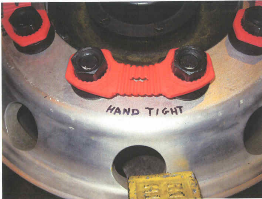
Figure 8 : Sample 10-03-C0152-6 installed on hand tight nuts