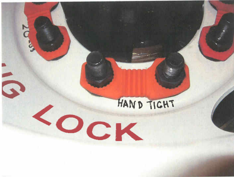
Figure 3 : Sample 10-03-C0152-1 installed on hand tight nuts