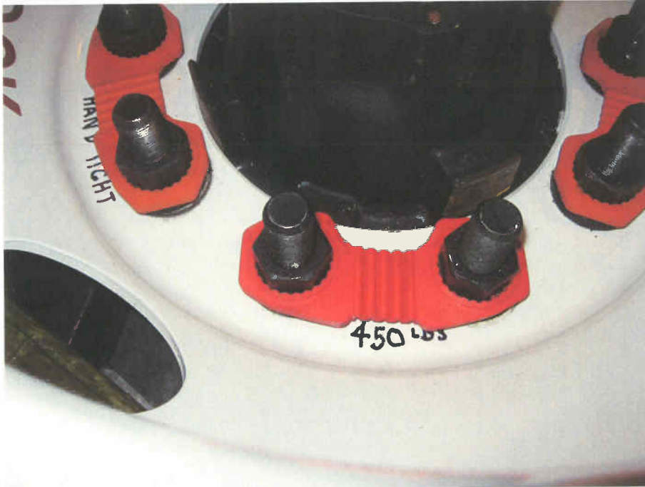
Figure 7 : Sample 10-03-C0152-5 installed on 450 ft-lb torque nuts