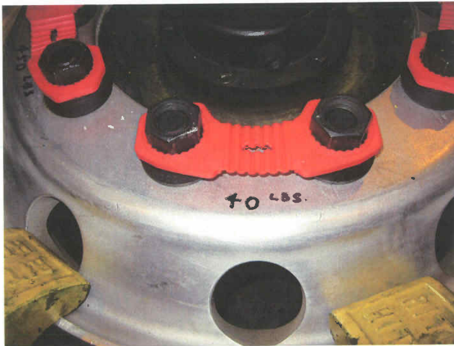
Figure 10 : Sample 10-03-C0152-8 installed on 40 ft-lb torque nuts