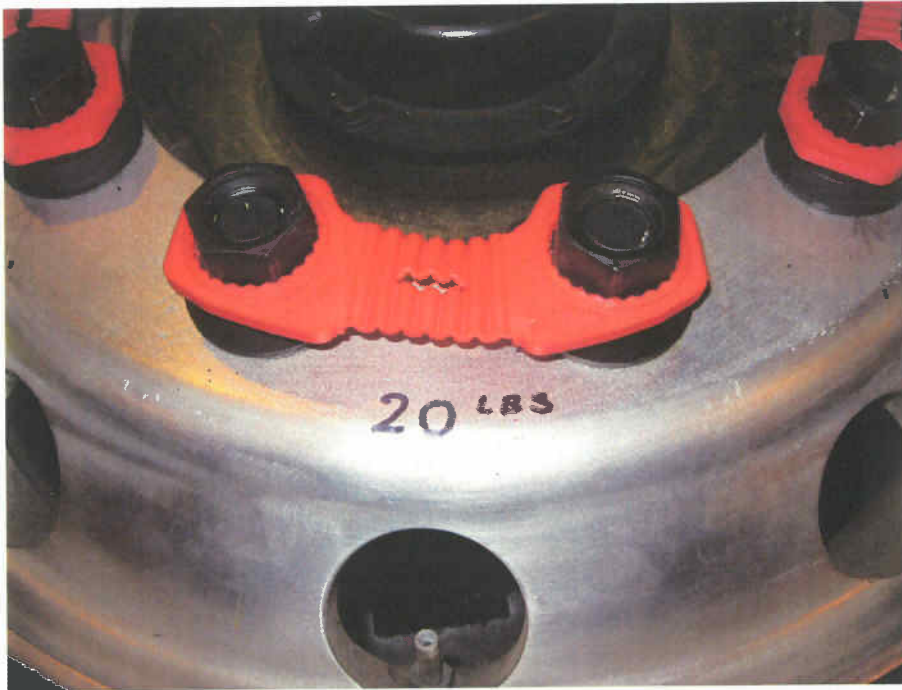
Figure 9 : Sample 10-03-C0152-7 installed on 20 ft-lb torque nuts