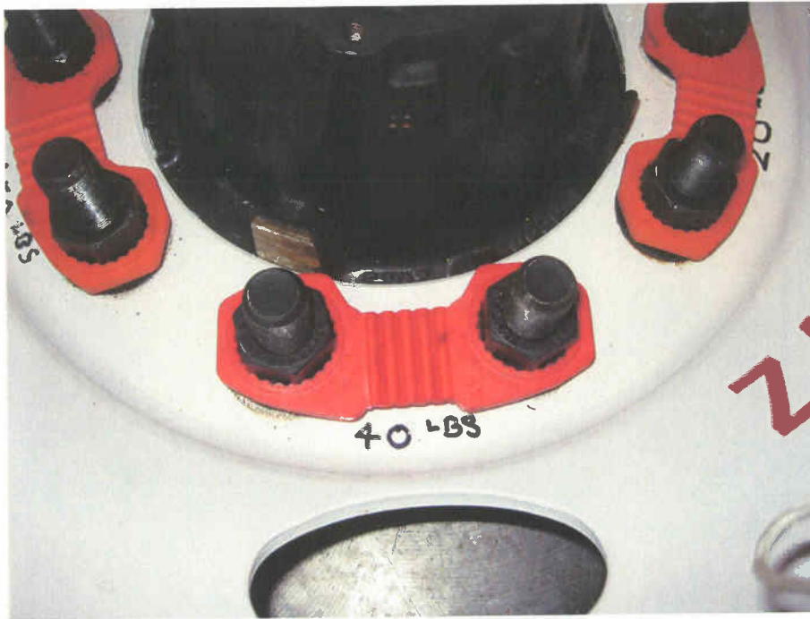
Figure 5 : Sample 10-03-C0152-3 installed on 40 ft-lb torque nuts